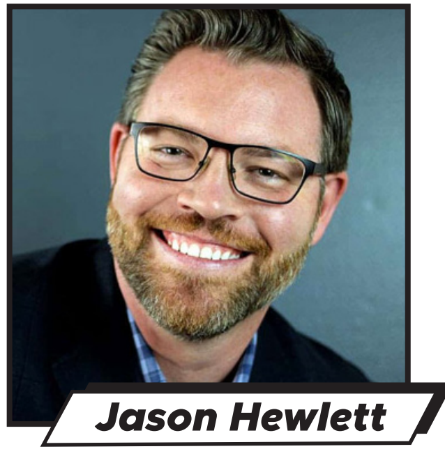
SOOMA SPONSORED KEYNOTE