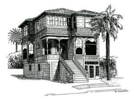
Our offices are located in Berkeley, in a circa 1900 Victorian Building.

RATE AND FEE STUDIES Our rate studies employ a cost-of-service approach and are designed to maintain the long-term financial health of a utility enterprise while being fair to all customers. We develop practical recommendations that are easy to implement and often phase in rate adjustments over time to minimize the impact on ratepayers. We also have extensive experience developing impact fees that equitably recover the costs of infrastructure required to serve new development. BWA has completed hundreds of water and wastewater rate and fee studies. We have helped communities implement a wide range of water and sewer rate structures and are knowledgeable about the legal requirements governing rates and impact fees including Proposition 218 and Government Code 66000. We develop clear, effective presentations and have represented public agencies at hundreds of public hearings to build consensus for our recommendations.