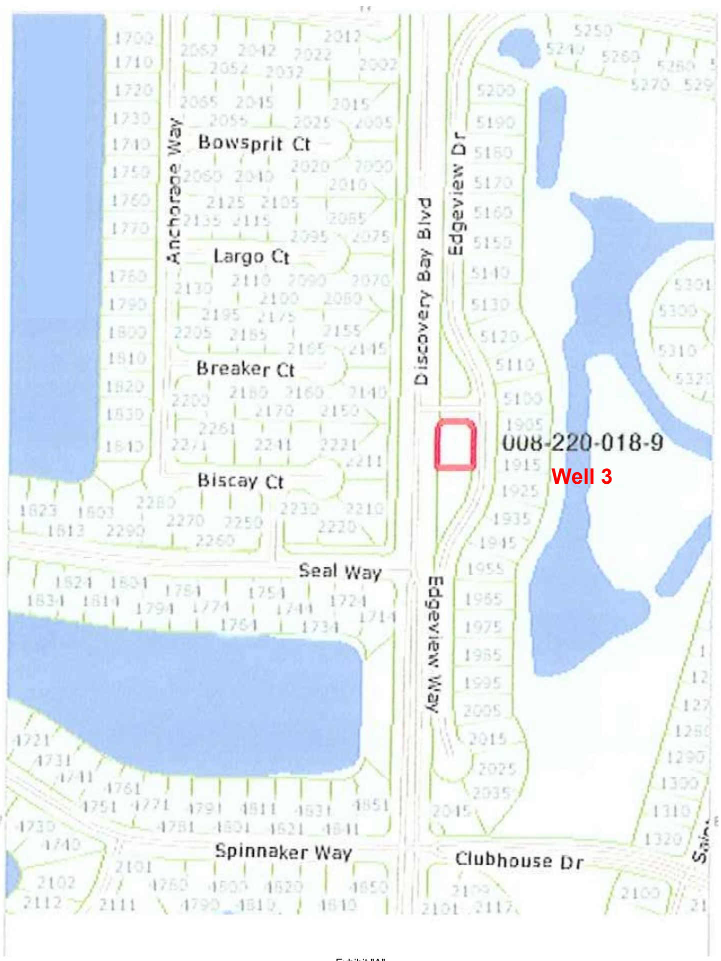
Exhibit "A" Premises Map