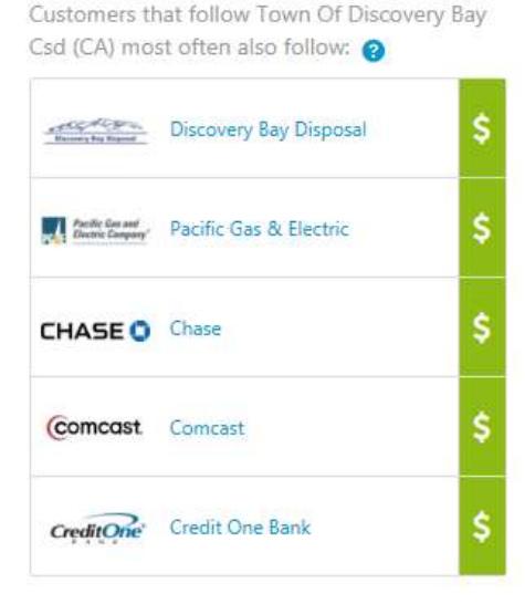
Discovery Bay, CA Byron, CA