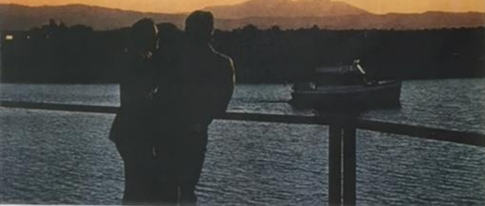
View of Mt. Diablo taken from Discovery Bay