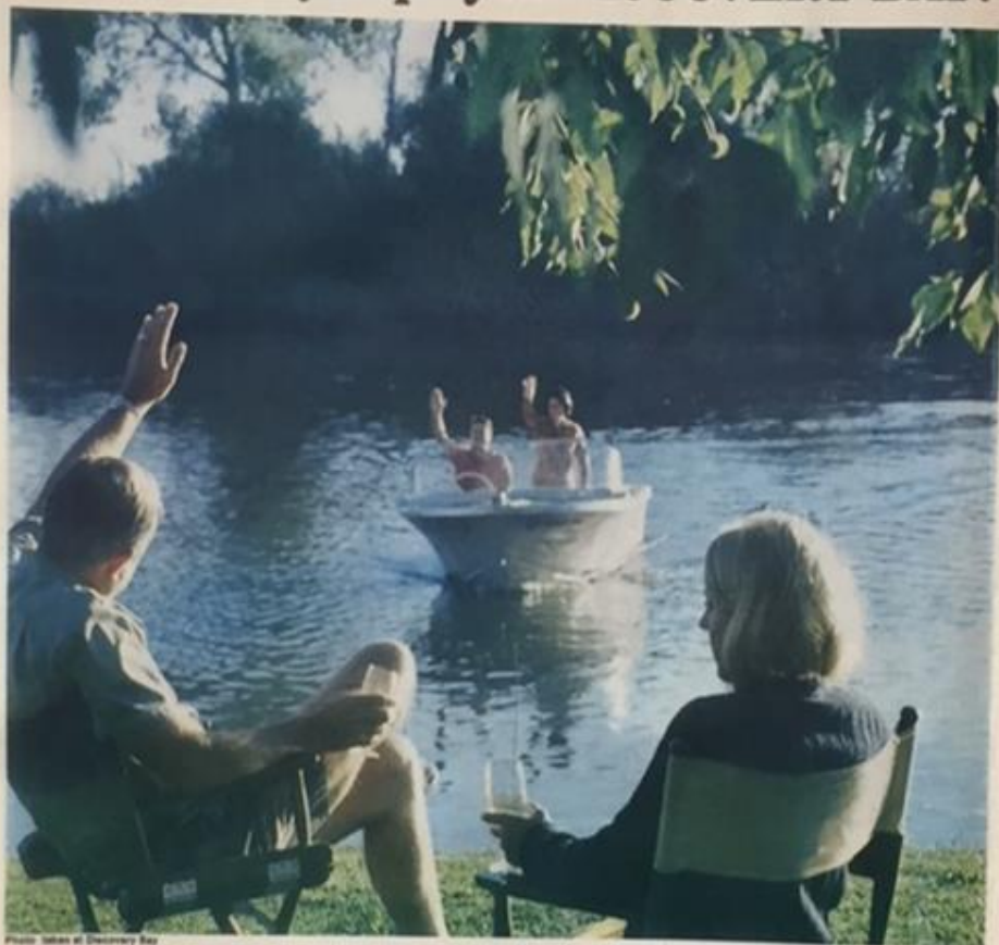
Photo taken at Discovery Bay

ON THE DELTA. A new residential recreational community for commuters, weekenders and people who want to live all the time on the water and in the wide outdoors.