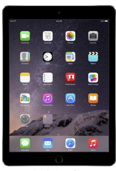
Hover Over Image to Zoom